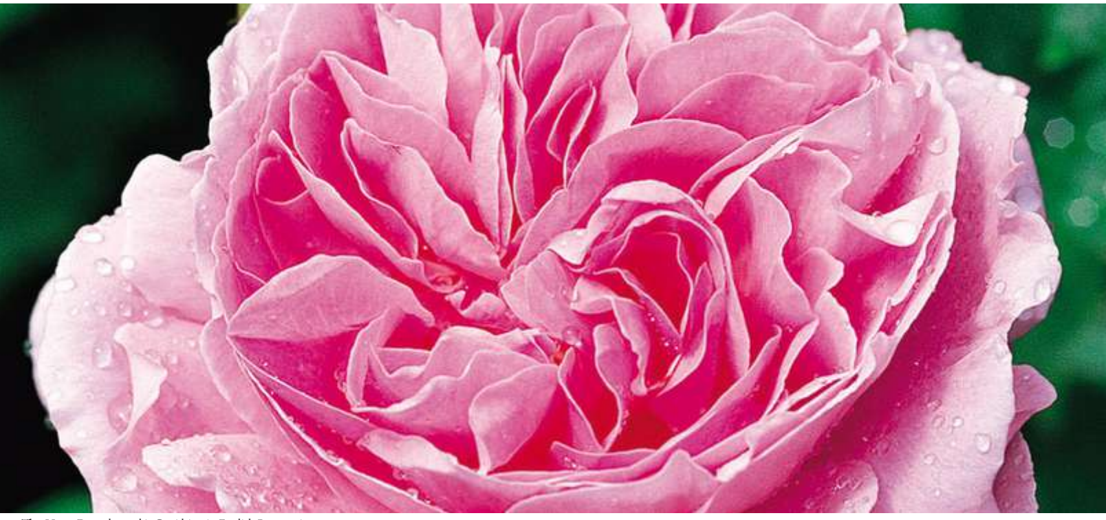
The Mary Rose, located in David Austin English Rose section.

HYBRID TEA GRANDIFLORA FLORIBUNDA SHRUB RUGOSA CLIMBING ENGLISH MINIATURE PATIO TREE MINIATURE TREE